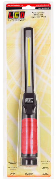
Part No. HH340