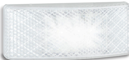
Part Number EU38WMHD - Blister Single EU38WMHDB - Bulk poly bag