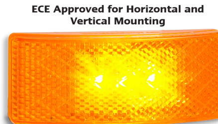
Part Number EU38AMHD - Blister Single EU38AMHDB - Bulk poly bag