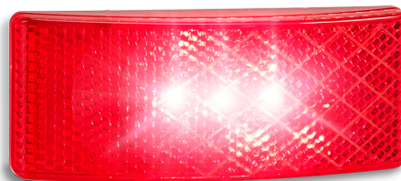
Part Number EU38RMHD - Blister Single EU38RMHDB - Bulk poly bag