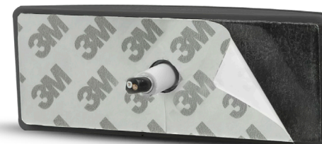
3M Tape Fitting