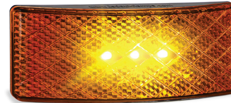
Part Number EU38BAMHDB - Bulk Poly Bag