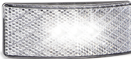
Part Number EU38BWMHDB - Bulk Poly Bag