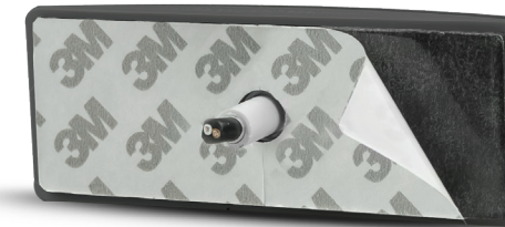
3M Tape Fitting