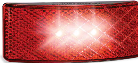
Part Number EU38BRMHDB - Bulk Poly Bag