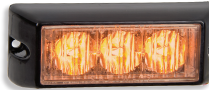
93AM - Box