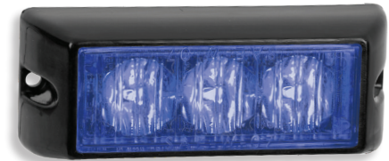
93BM - Box