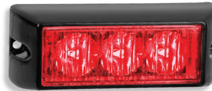
93RM - Box