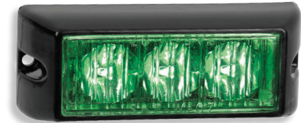
93GM - Box