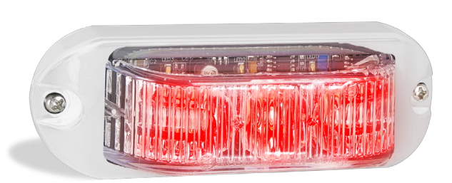
Red Marine Lamp 91RM - Blister