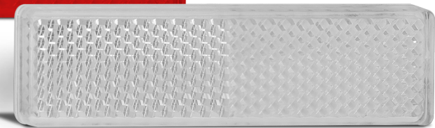
9020W - Twin Blister 9020WB - Box of 100