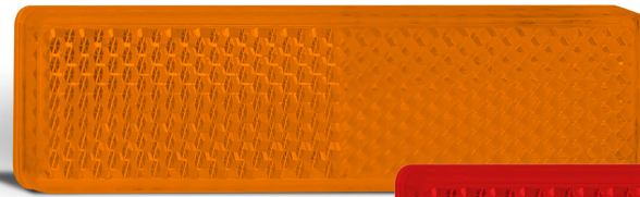
9020A - Twin Blister 9020AB - Box of 100