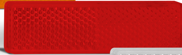
9020R - Twin Blister 9020RB - Box of 100