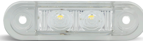
Part Number 7922WM2 - Twin Blister