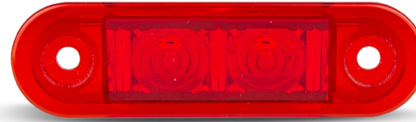
Part Number 7922RM2 - Twin Blister

ECE Approved 100% Waterproof 5 Year Warranty