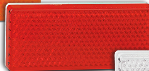
7030R - Twin Blister 7030RB - Box of 100