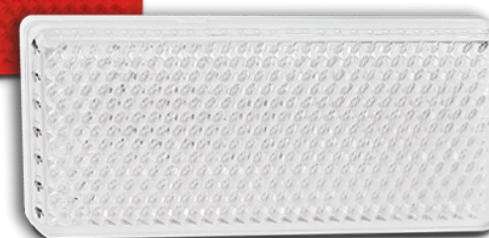
7030W - Twin Blister 7030WB - Box of 100

Function Reflex Reflector Size 70mm x 30mm x 6mm Lens PMMA Base ABS