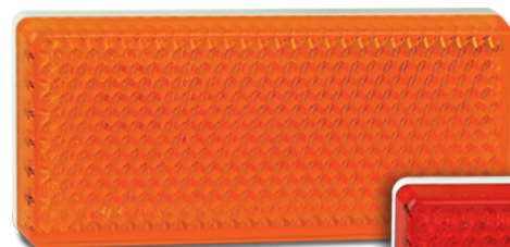
7030A - Twin Blister 7030AB - Box of 100