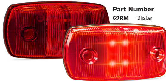
Part Number 69RM - Blister