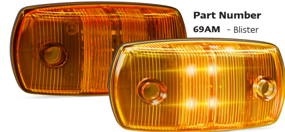
Part Number 69AM - Blister