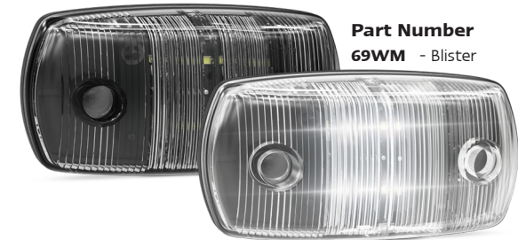
Part Number 69WM - Blister