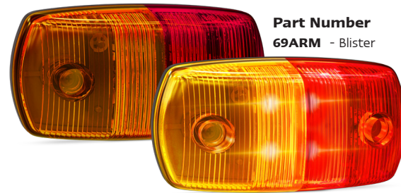
Part Number 69ARM - Blister