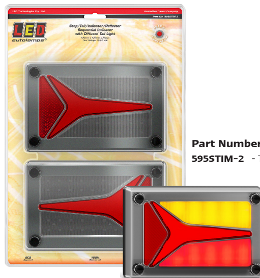
Part Number 595STIM-2 - Twin Blister