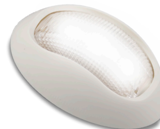
Part Number 52WW - Blister