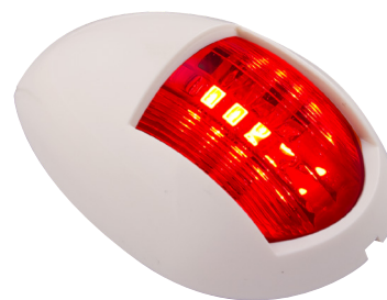
Part Number 52WR - Blister