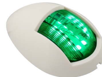
Part Number 52WG - Blister