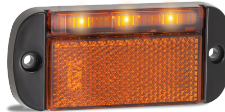
Part Number 44AME - Blister 44AMEB - Bulk poly bag