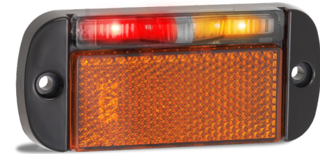
Part Number 44ARMRB - Bulk poly bag, RHS 44ARMLB - Bulk poly bag, LHS 44ARMRCSB - CSB Plug, Bulk poly bag, RHS 44ARMLCSB - CSB Plug, Bulk poly bag, LHS