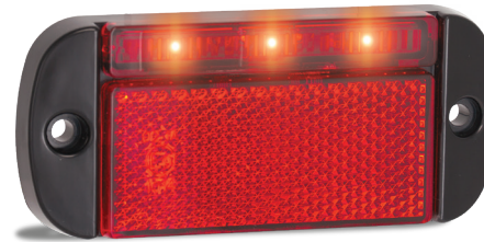
Part Number 44RMEB - Bulk poly bag 44RMEB4M - 4m cable, Bulk poly bag