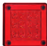
Part No. 280RMB