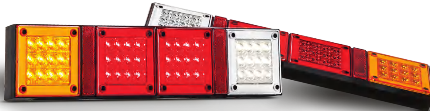
Stop/Tail/Indicator/Reverse/Reflectors 420ARRWM2 - Twin Blister, 12-24 Volt

Function Stop/Tail/Indicator/Reverse Reflectors