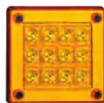
Part No. 280AMB