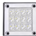
Part No. 280WMB