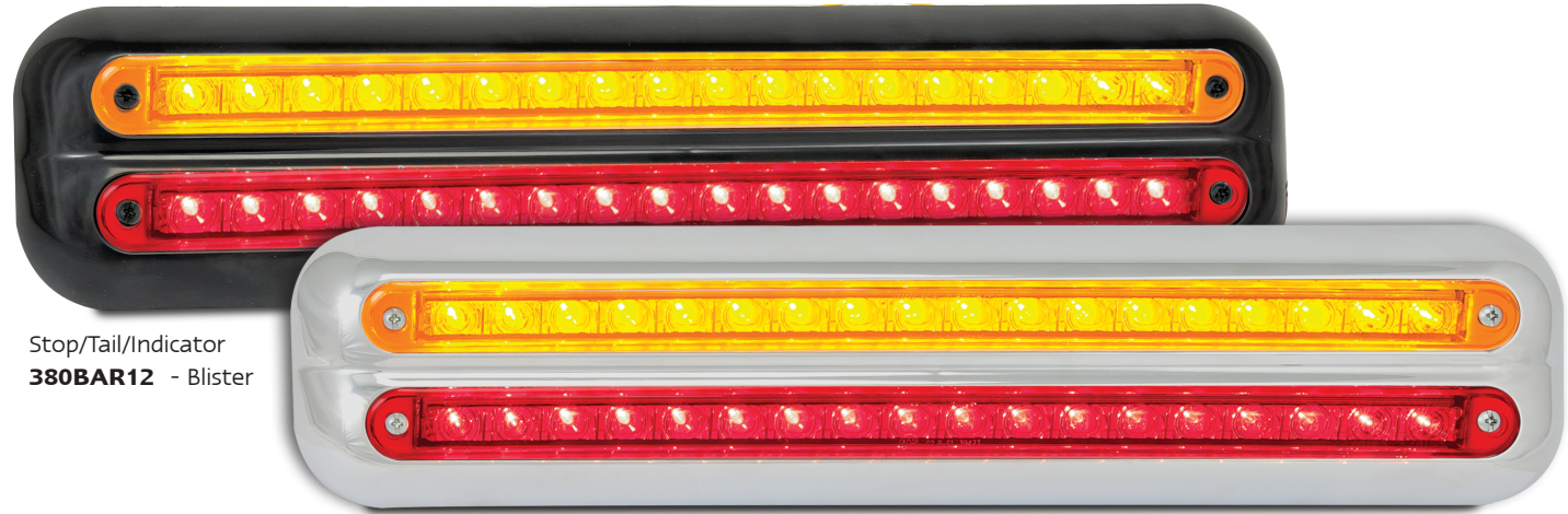
Stop/Tail/Indicator 380BAR12 - Blister