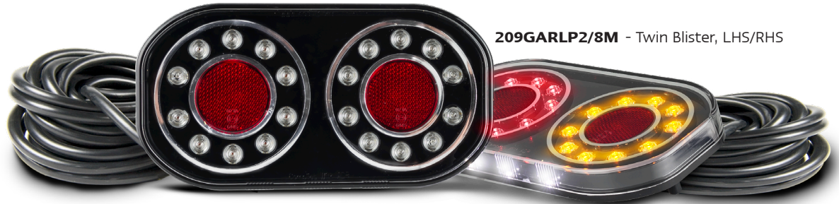
209GARLP2/8M - Twin Blister, LHS/RHS