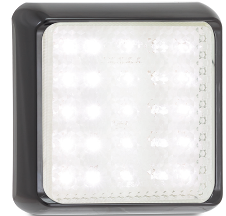
Reverse 125WM - Single Blister