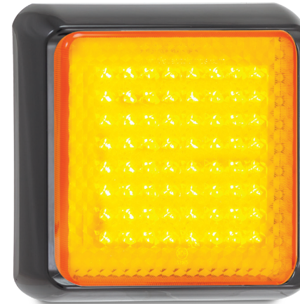
Rear Indicator 125AM - Single Blister