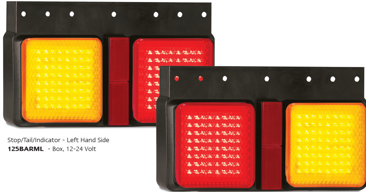
Stop/Tail/Indicator - Left Hand Side 125BARML - Box, 12-24 Volt