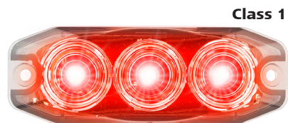
Part No. 120033RM