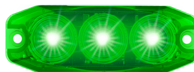
Part No. 120033GM