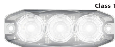
Part No. 120033WM