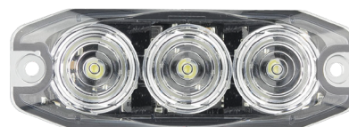
Clear Lens when Inactive

Function Emergency Lamp Size 89mm x 30mm x 8mm Voltage Multivolt 12-24V LED Qty 3 x 3 Watt Cable 25cm