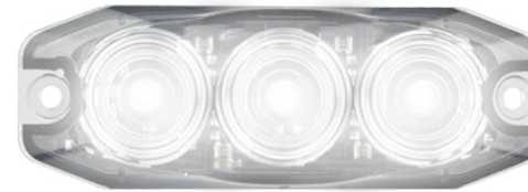
Part No. 11WM-2

Function Stop/Tail/Rear Indicator/Reverse Size 89mm x 30mm x 8mm Voltage Dual Voltage 12-24V LED Qty 3 Cable 25cm