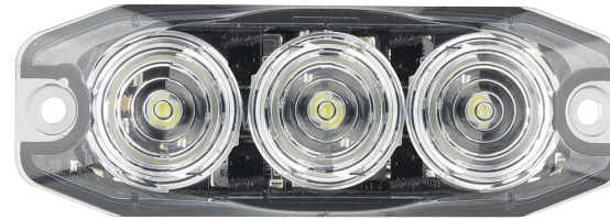
Clear Lens when Inactive