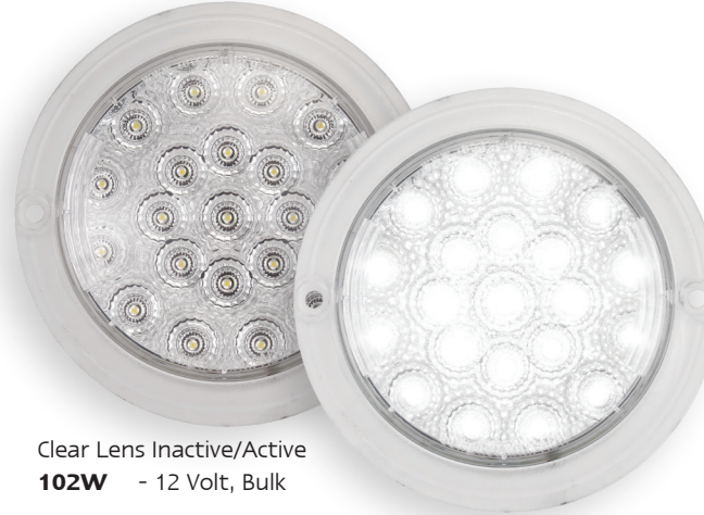
Clear Lens Inactive/Active 102W - 12 Volt, Bulk