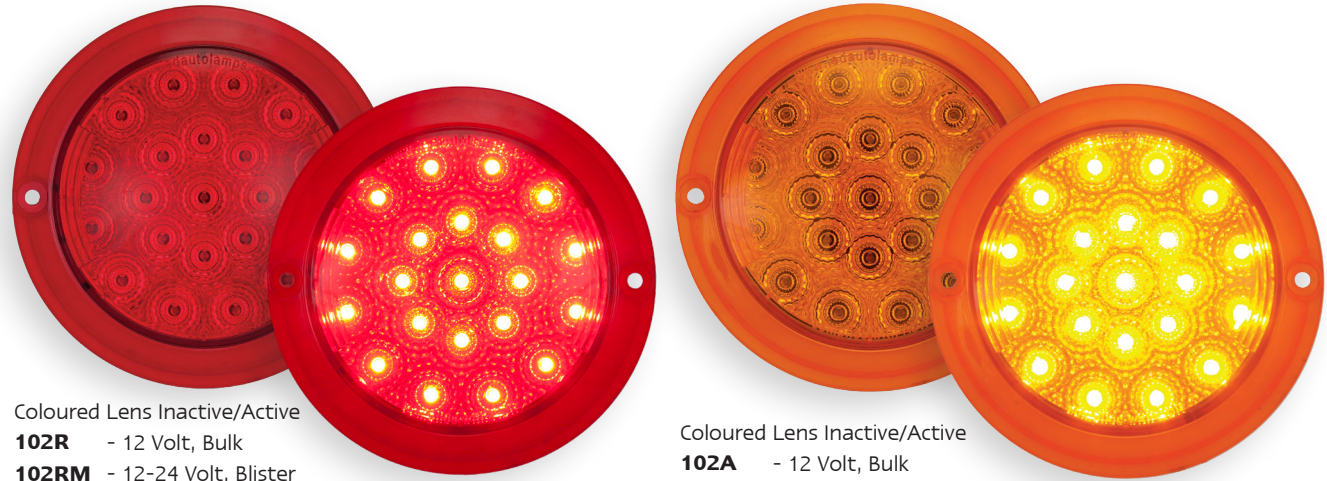
Coloured Lens Inactive/Active 102R - 12 Volt, Bulk 102RM - 12-24 Volt, Blister