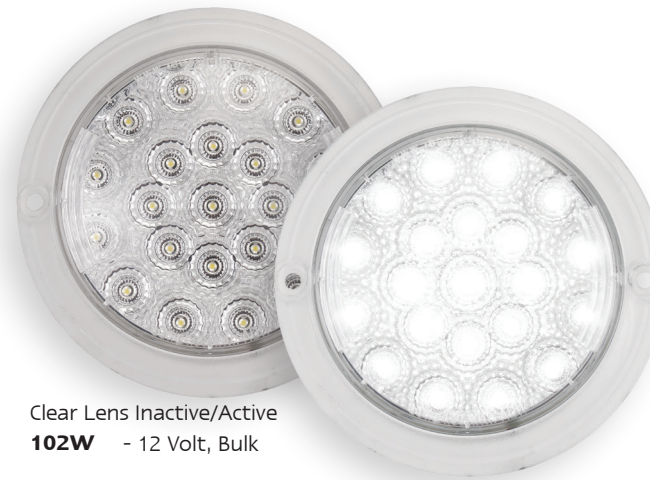
Clear Lens Inactive/Active 102W - 12 Volt, Bulk