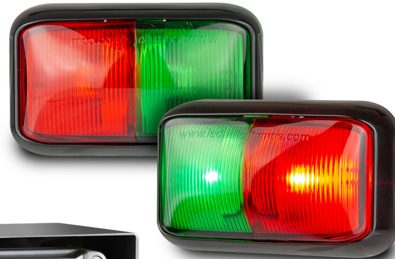
Part No. SO58RGM - Single Bulk