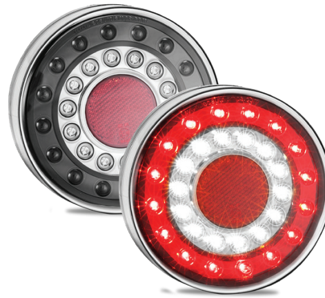
Stop/Tail/Reverse/Reflector MaxilampC1RXCE - Single Blister, with Bolts