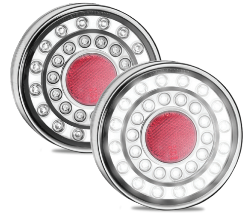
Reverse/Reflector Maxilamp1XCWE - Single Blister, with Bolts