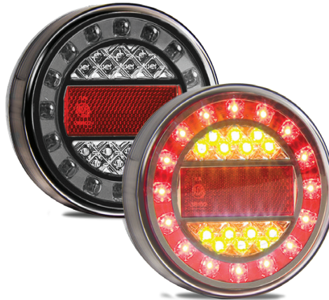
Stop/Tail/Indicator/Reflector MaxilampC1XRE - Single Blister, with Bolts