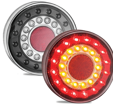
Stop/Tail/Indicator/Reflector MaxilampC1XCE - Single Blister, with Bolts MaxilampC1XCE3M - Bulk, with 3M Tape