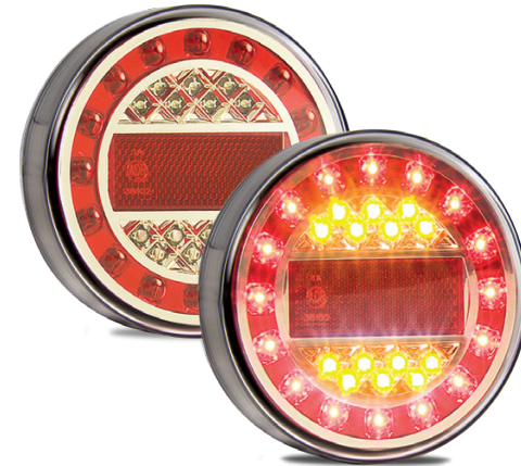
Stop/Tail/Indicator/Reflector Maxilamp1XRE - Single Blister, with Bolts