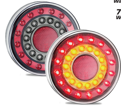
Stop/Tail/Indicator/Reflector Maxilamp1XC - Single Blister, with Bolts