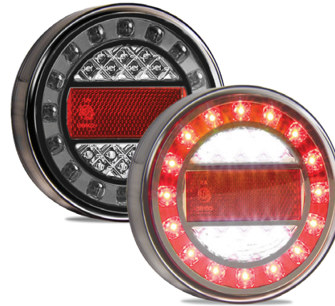
Stop/Tail/Reverse/Reflector MaxilampC1RXRE - Single Blister, with Bolts