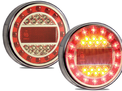
Stop/Tail/Indicator/Reflector Maxilamp1XRE - Single Blister