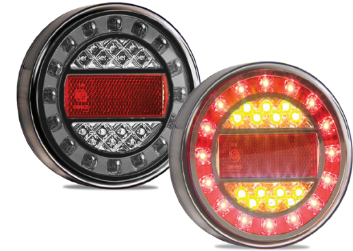
Stop/Tail/Indicator/Reflector MaxilampC1XRE - Single Blister