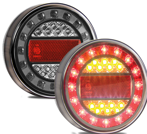
Stop/Tail/Indicator/Reflector Maxilamp1XRE - Single Blister, with Bolts