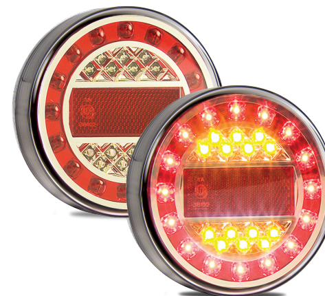
Stop/Tail/Indicator/Reflector MaxilampC1XRE - Single Blister, with Bolts