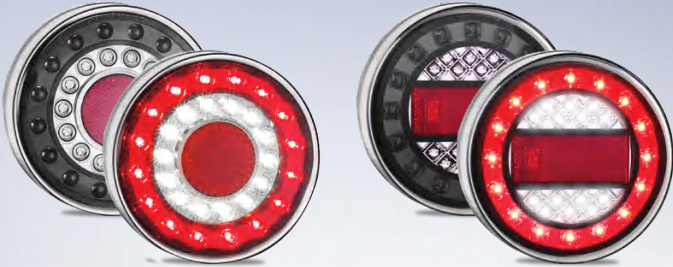
Part No. MAXILAMPC1RXCE