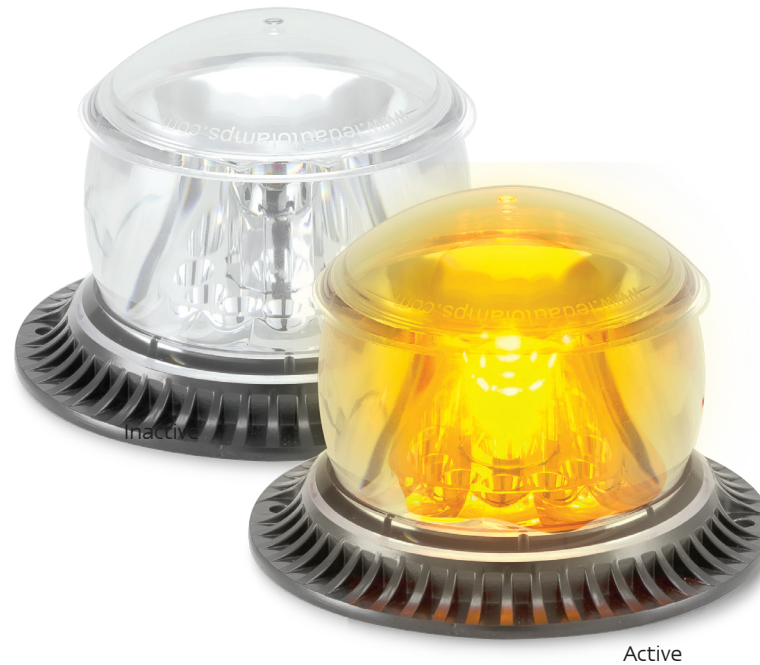
Amber Strobe Beacon, Clear Lens MB12AMC - Blister