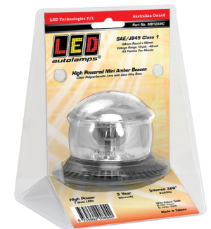
Part No. MB12AMC

Run wires through hole in fixing surface or from the side of the base. Attach with screws provided; ensure foam gasket is between lamp and fixing surface.