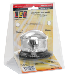
Part No. MB12AMC