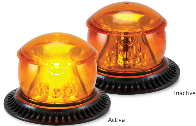
Amber Strobe Beacon, Amber Lens MB12AM - Blister