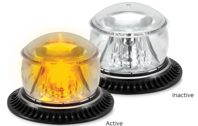
Amber Strobe Beacon, Clear Lens MB12AMC - Blister