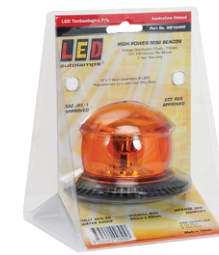
Part No. MB12AM

Run wires through hole in fixing surface or from the side of the base. Attach with screws provided; ensure foam gasket is between lamp and fixing surface.