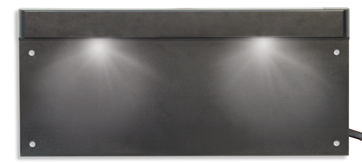
P/N LP1 - Blister P/N LP1B - Box

ApprovalsFunctionApprovalADRLicence 48/00CTA-039611