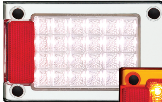
Reverse Lamp J3WM - Includes Bracket, Blister J3WMB - Lamp Only, Bulk