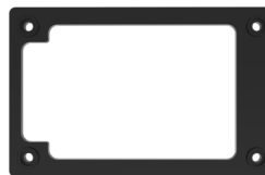
Part No. J3B1B