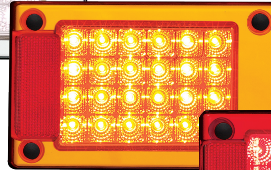
Rear Indicator Lamp J3AM - Includes Bracket, Blister J3AMB - Lamp Only, Bulk