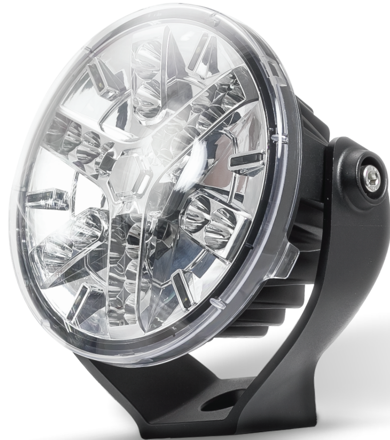
HL198 - Twin Blister