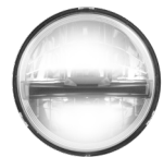
High Beam Active