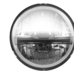
Low Beam Active