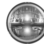
Park Lamp Active