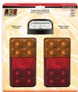
Part No. H155BARLP2/6 - Twin Blister Kit