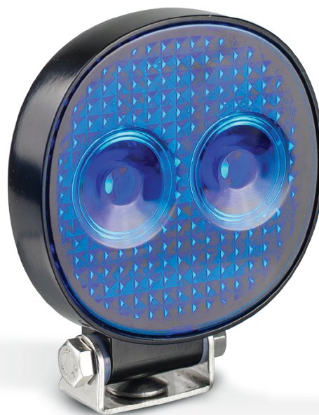
7512BMB - Blister