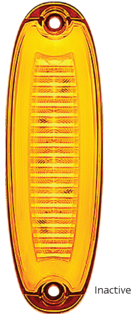
Part Number CAB12B - Single Box