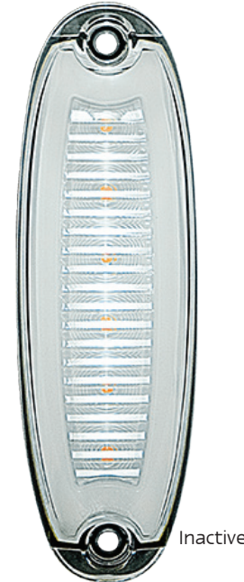
Part Number CAB26B - Single Box