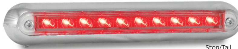
Part No. 235CCR12