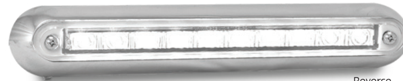
Part No. 235CCW12E