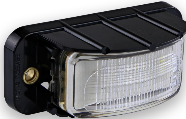
Part Number 95BLMB - Bulk Poly Bag