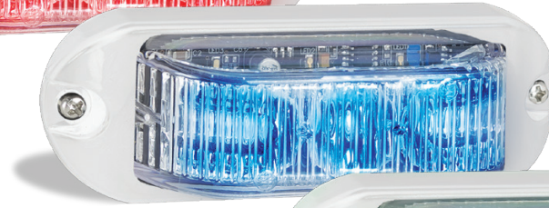
Blue Marine Lamp 91BM - Blister