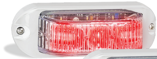
Red Marine Lamp 91RM - Blister