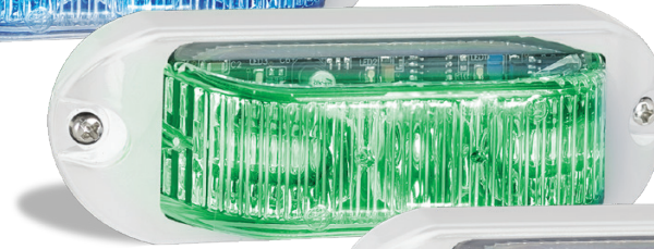
Green Marine Lamp 91GM - Blister