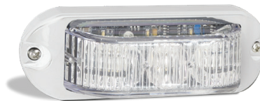
Clear Lens when Inactive