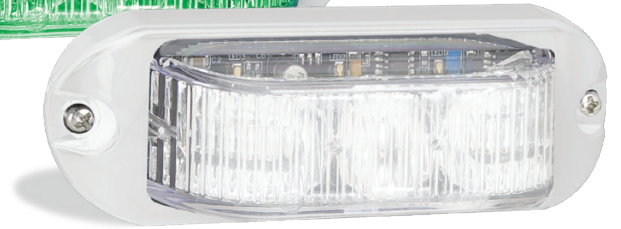
White Marine Lamp 91WM - Blister