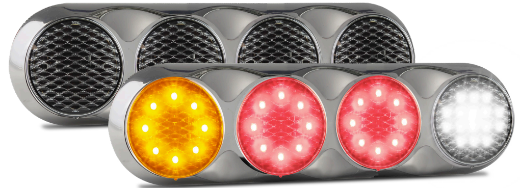
Stop/Tail/Indicator/Reverse 82CARRW - Black Chrome, Clear Lens, Blister