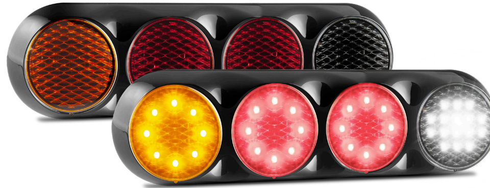
Stop/Tail/Indicator/Reverse 82BARRW - Black, Coloured Lens, Blister