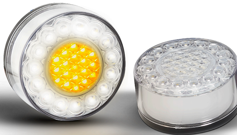
P/N 80AW - 12 Volt, Blister