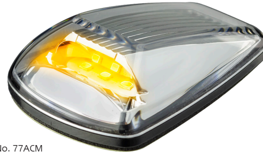
Part No. 77ACM Clear Lens - Amber LEDs