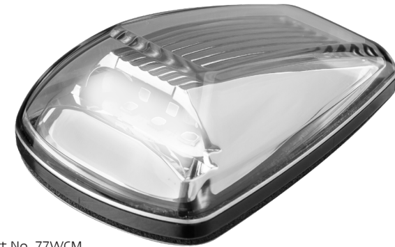
Part No. 77WCM Clear Lens - White LEDs