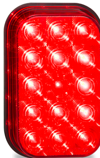
Stop/Tail 5940RM - Single Blister 5940RMB - Bulk