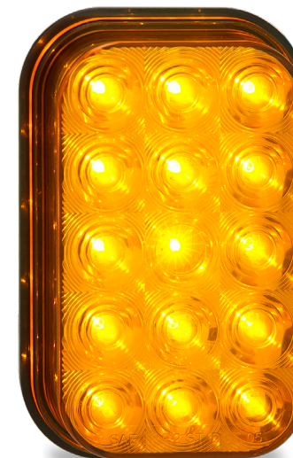
Rear Indicator 5940AM - Single Blister 5940AMB - Bulk