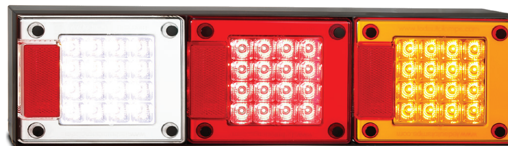
Stop/Tail/Indicator/Reverse/Reflector 460ARWM - Blister, 12-24 Volt 460ARWMB - Box, 12-24 Volt