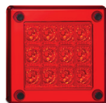
Part No. 280RMB