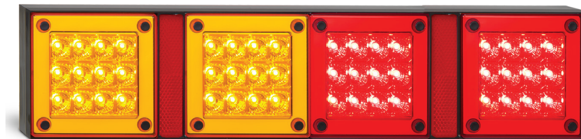
Stop/Tail/Indicator/Reflectors 420ARRM - Blister, 12-24 Volt