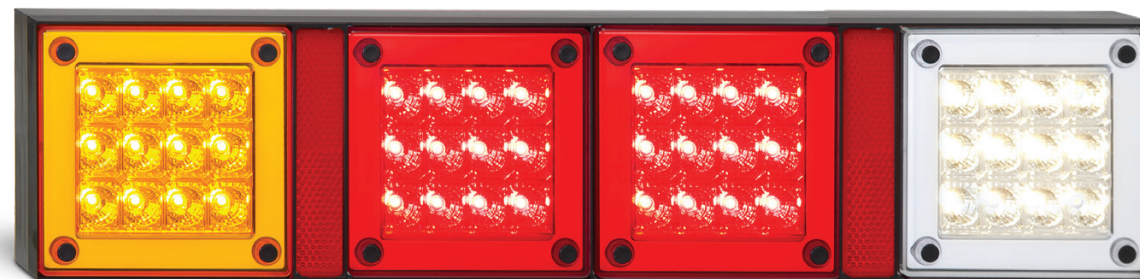
Stop/Tail/Indicator/Reverse/Reflectors 420ARWM - Blister, 12-24 Volt