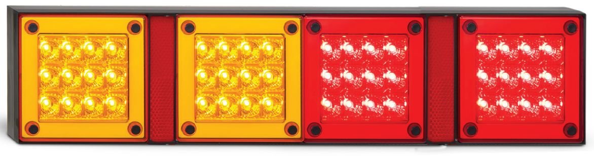
Stop/Tail/Indicator/Reflectors 420ARRM - Blister, 12-24 Volt