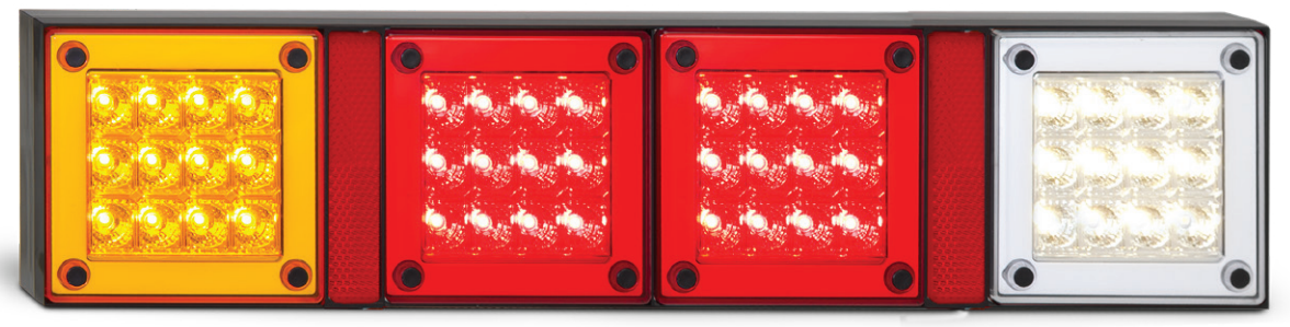
Stop/Tail/Indicator/Reverse/Reflectors 420ARWM - Blister, 12-24 Volt