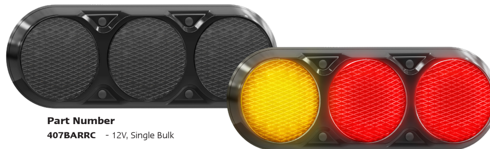
Part Number 407BARRC - 12V, Single Bulk