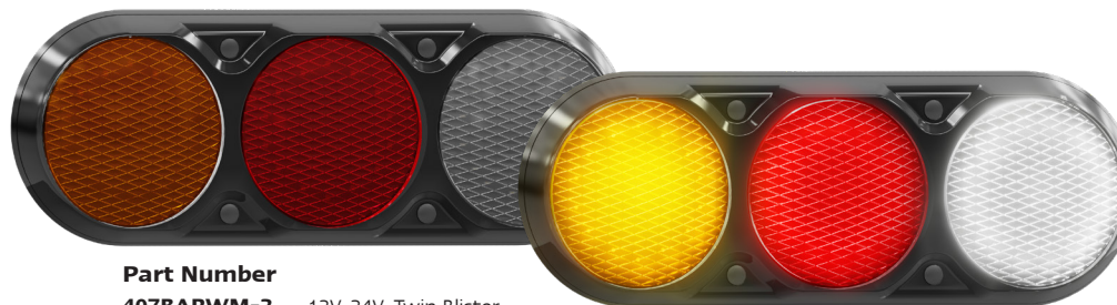
Part Number 407BARWM-2 - 12V-24V, Twin Blister

ADR Approved 100% Waterproof 5 Year Warranty