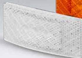
Part No. EU38WMHD