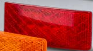
Part No. EU38RMHD