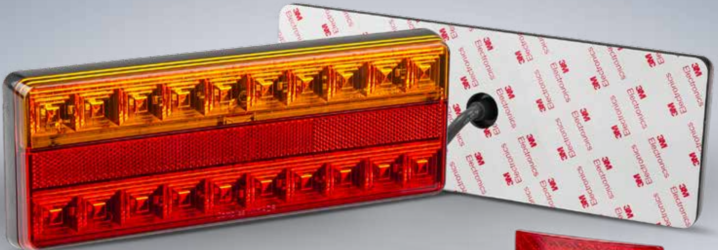
Part No. 275ARB3M

No Bolts or Screws only 3M Tape for Fitting