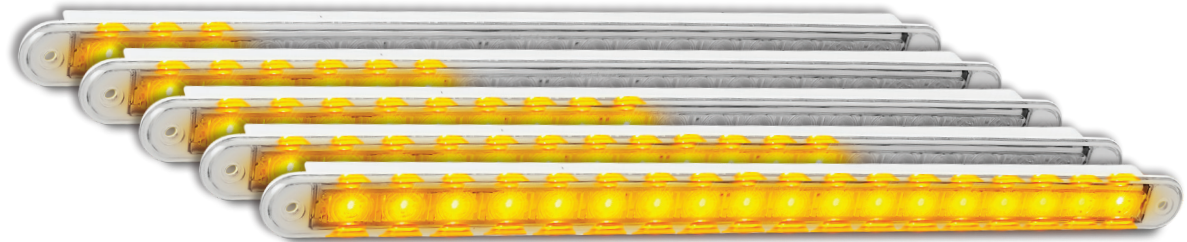
Part Number 380CSEQ-2 - Clear Lens, Twin Blister