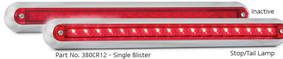
Part No. 380CR12 - Single Blister