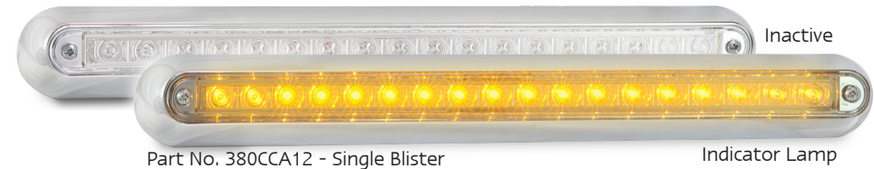
Part No. 380CCA12 - Single Blister