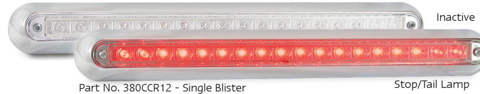
Part No. 380CCR12 - Single Blister