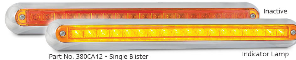
Part No. 380CA12 - Single Blister